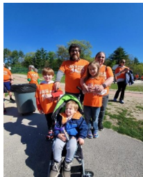
The Biron family do a Mother's Day walk!