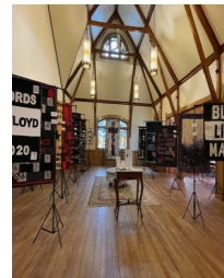
The BLM quilt at the UU church Voice helped.