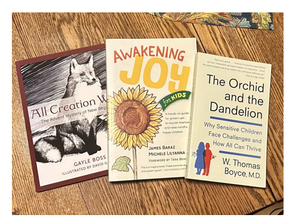
Three New Books for Children's Church

For more info, visit the Nashua Chamber Orchestra's Facebook page, or website: nco-music.org.