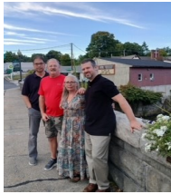
Recognize these members of Prenup?