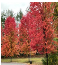
Our beautiful maples !

I'd love to show you and your family finding or spreading Joy... Won't you share? Facebook friend me or email to the office. office@milfordumc.org