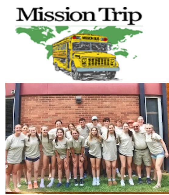
2023 Youth Mission Team

Remember to think about your gift card needs for the big gift giving season coming up, We will be selling gift cards in November.