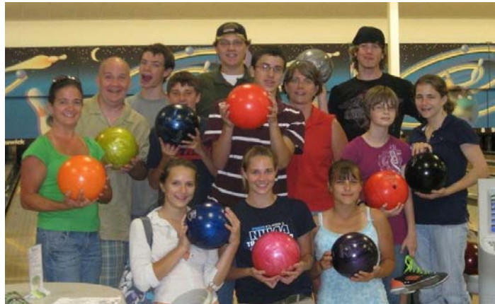
Youth group bowling night in August

We will be meeting on September 13th to decide what activities you would like to enjoy for the first half of the year. Remember, come at 4:30 pm if you are in middle school and at 6 pm if you are in high school. Come with a list of ideas we can all enjoy. See you soon!